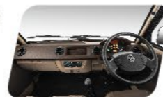
DUAL TONE INTERIORS

For further details, please contact: 1800 1022 666 (toll-free) www.ashokleyland.com Or write to us at: Ashok Leyland Limited, 6th Floor - LCV Marketing, No.1 Sardar Patel Road, Guindy, Chennai - 600 032. Tel: (044) 22206000